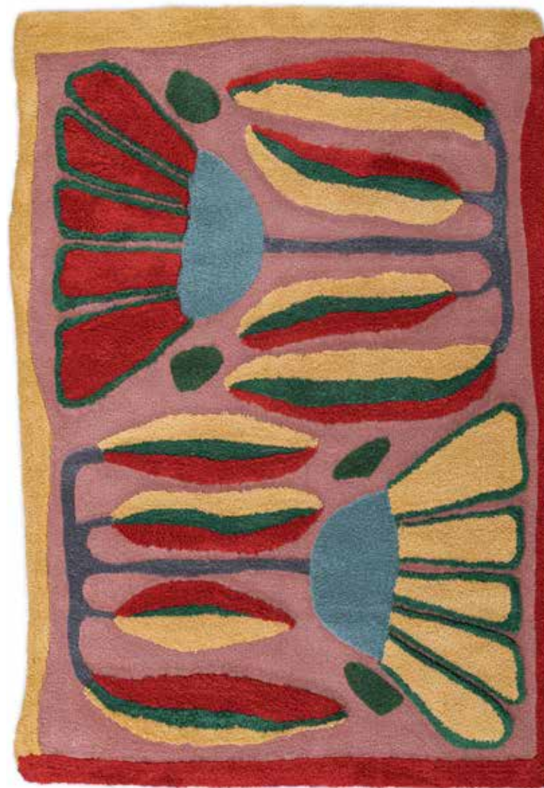
Twin Flowers, 1,55 x 2,1 mt