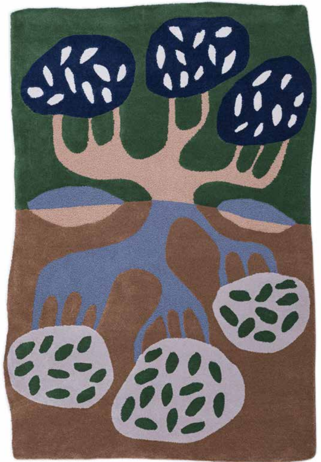
top: Bloom Room, 1,55 x 2,1 mt right: Secret Life, 1,85 x 2,6 mt