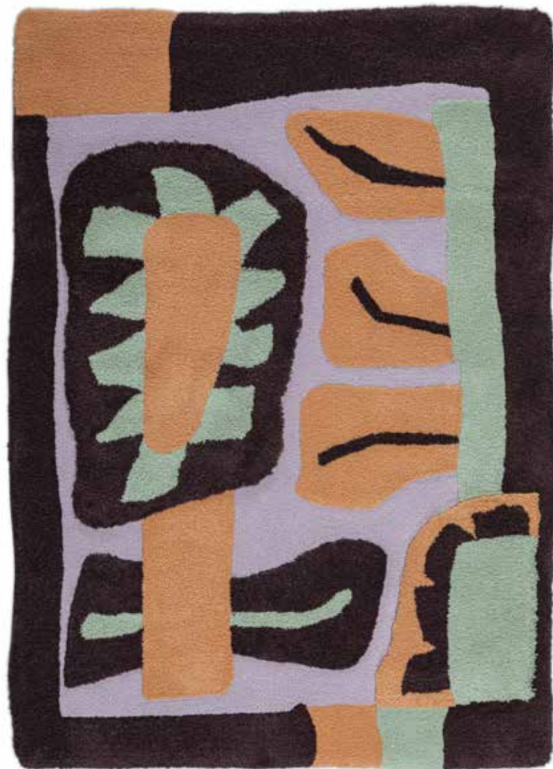
left: Forest Floor, 1,55 x 2,1 mt top: Botanical Abstraction, 1,85 x 2,6 mt