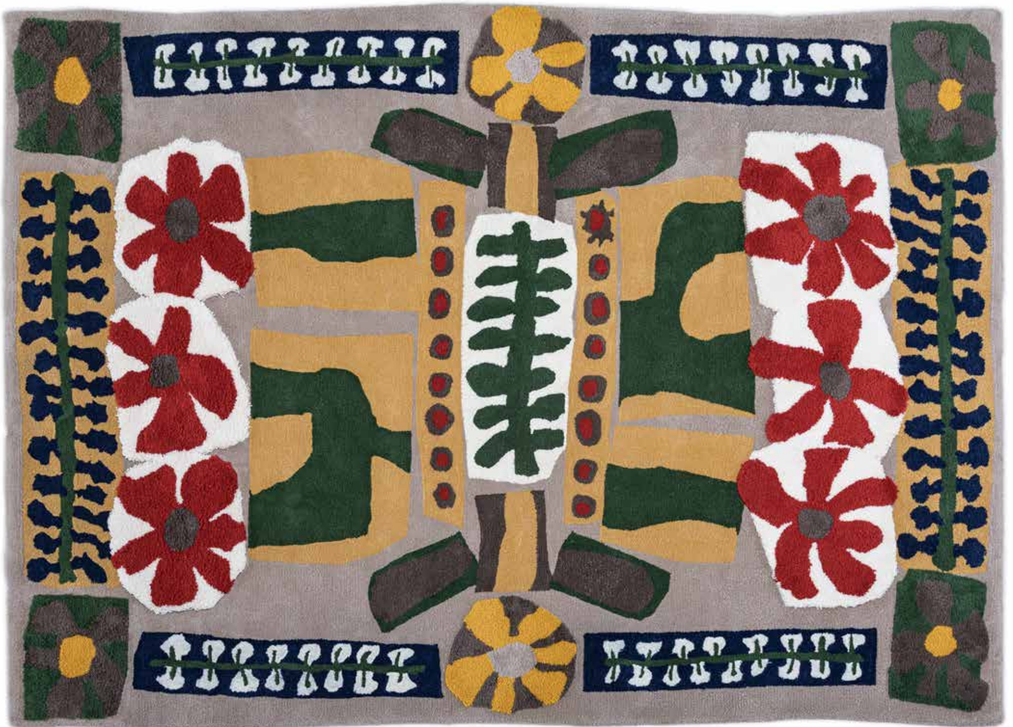
Inner Garden, 2,5 x 3,5 mt