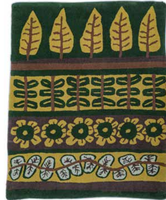
Flower Bed, 1,55 x 2,1 mt