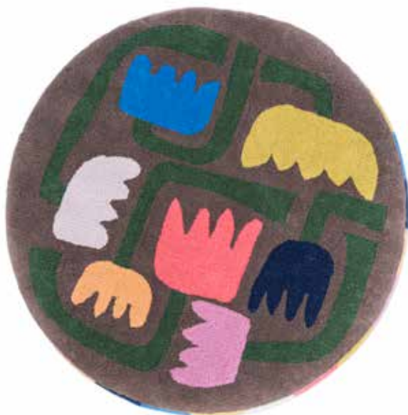
Tulip Dance, 1,00 mt diameter